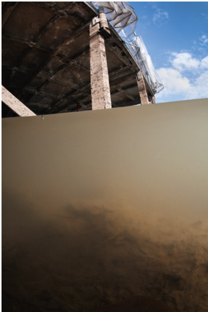
ANDREAS MÜLLER-POHLE New Territories – Lantau Island, 2009