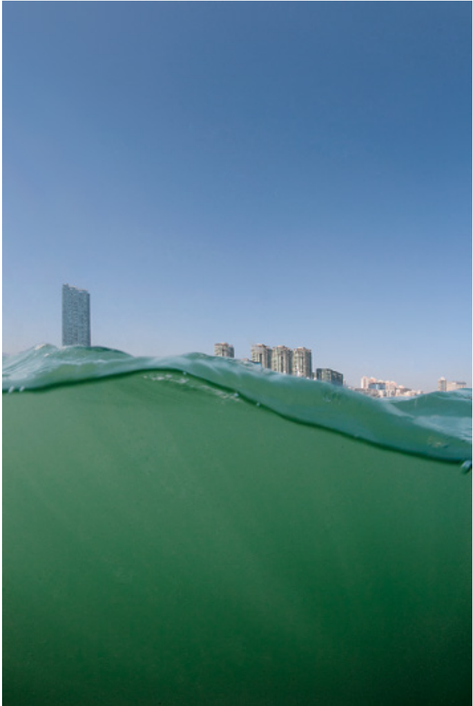
ANDREAS MÜLLER-POHLE Kowloon – From a Boat in Kowloon Bay, 2009